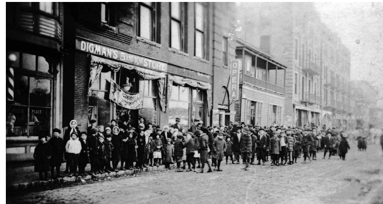
Children lining up to see a show at the Opera House in 1910