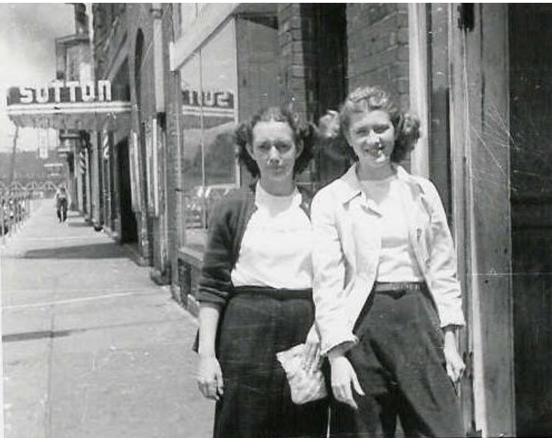
Moviegoers pose on Front Street in 1948