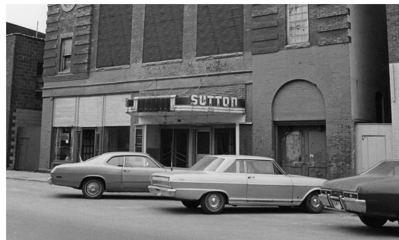
A closed Sutton Theatre in the late 1970s