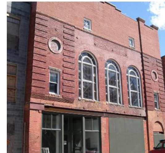
Ongoing stabilization work in 2008