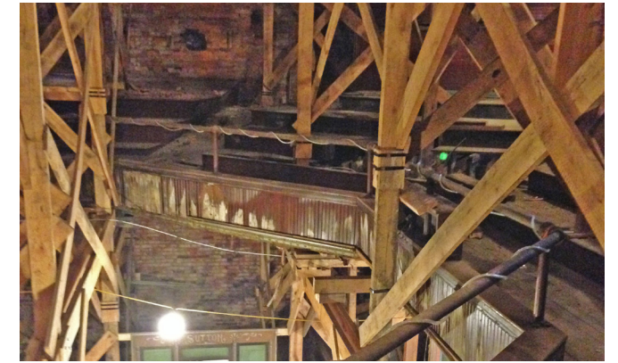
Scaffolding supports the balcony and roof.