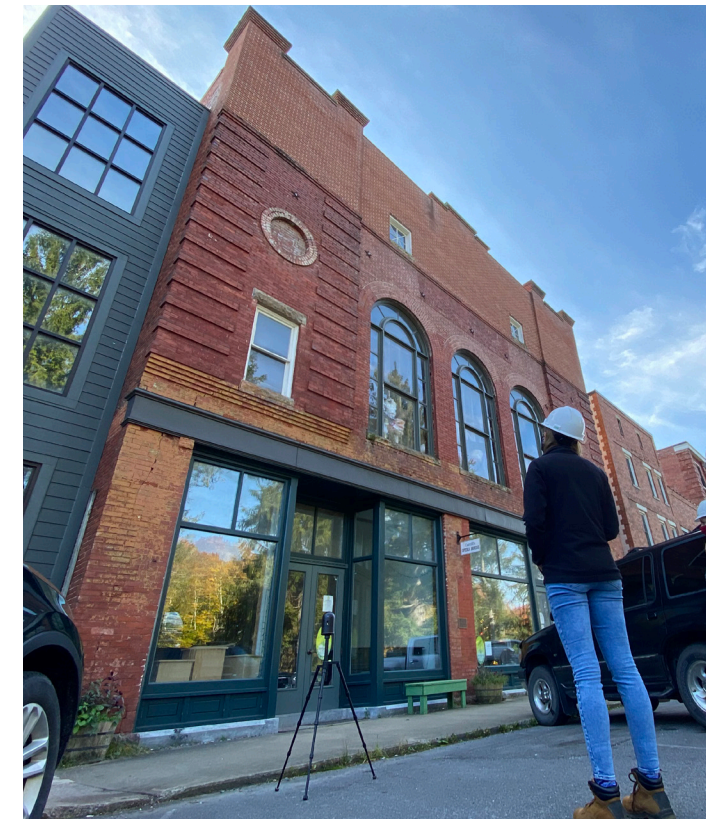
The Mills Group surveying the Opera House in fall of 2020