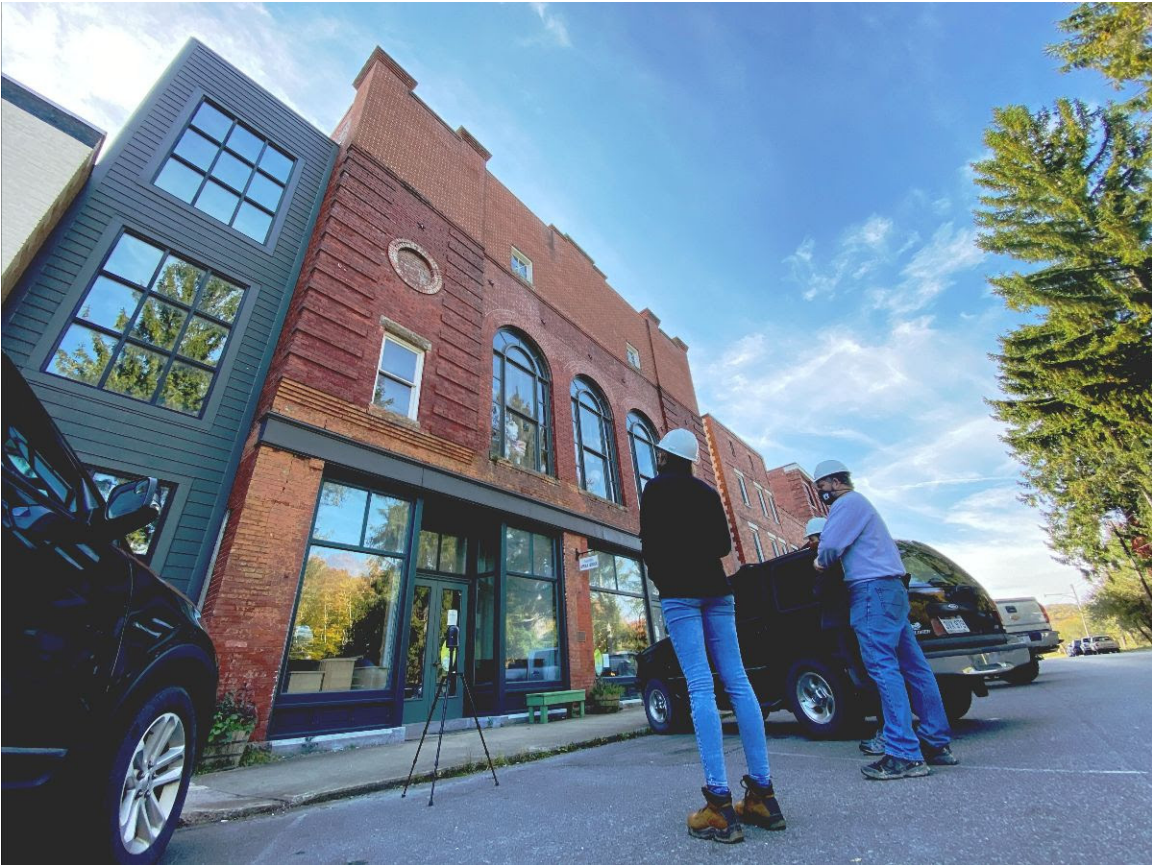
The Mills Group onsite last week, scanning the exterior of Cottrill's Opera House (note the Leica scanning unit, on a tripod near the sidewalk).