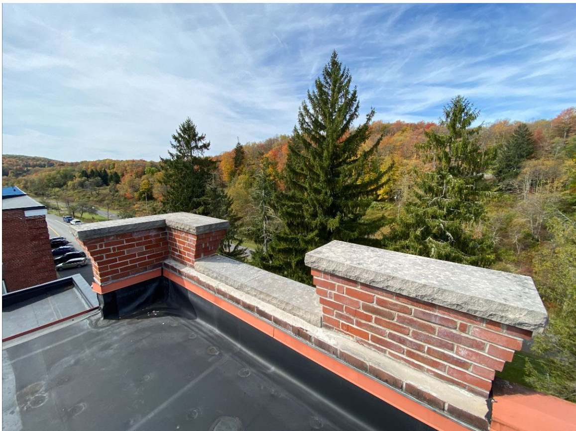
View from the top! Looking south down Front Street in Thomas from the roof of Cottrill's Opera House.

Last Friday, I stepped out onto the roof for the first time. The visit spurred two thoughts: