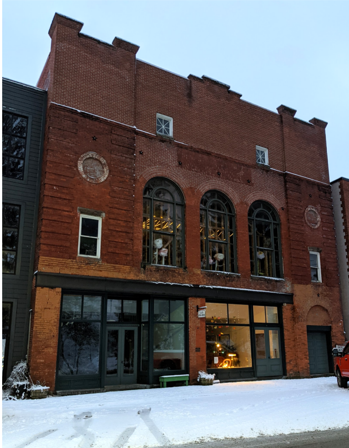
Looking at Cottrill's Opera House on a snowy day.

We've covered a lot of new ground in the past few years as an organization. As the newest member of the board, it's clear to me that we wouldn't be in such a strong position without help from so many places. In a lot of ways, we're learning as we go, and we're grateful for the support from our community and our partnering organizations.