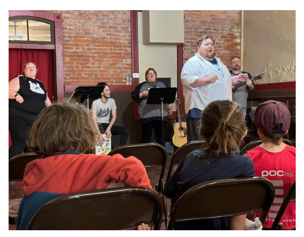
Thanks again to our guests, <u>@rusticmechanicals</u>, for leading two sessions of "Shakespearaoke" this afternoon! Live music, acting, and dance — with the audience!

As part of ArtSpring weekend, we hosted an interactive musical celebration, featuring <u>The Rustic Mechanicals</u> for two performances of Shakespearaoke . They were fantastic and we can't wait to have them back!