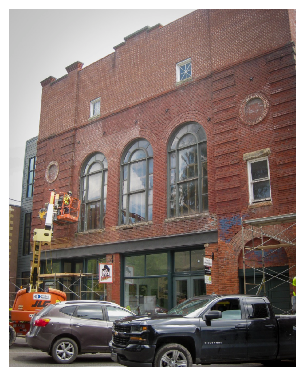
The Opera House during brick restoration in 2021.

Now to the brick and mortar of it all: We are currently assembling a few bid packages for a variety of incremental projects. We are building those packages with a goal to do as much work as possible with local contractors. Barring unforeseen complications, you should be seeing restoration work going on at the Opera House this year.