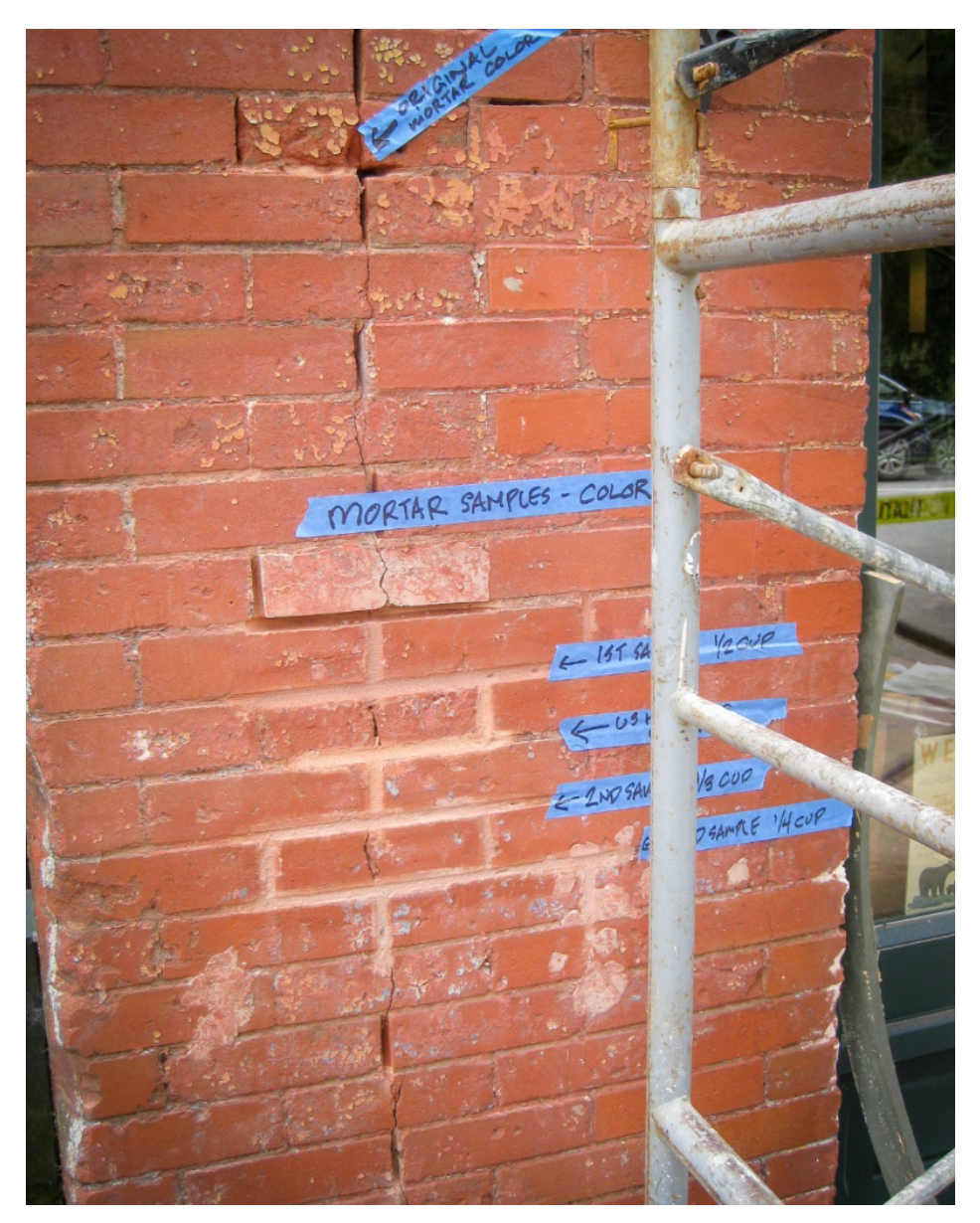
Samples to match the original mortar from 1902.

2021 Brick Repair and Repointing -- and more work to come!